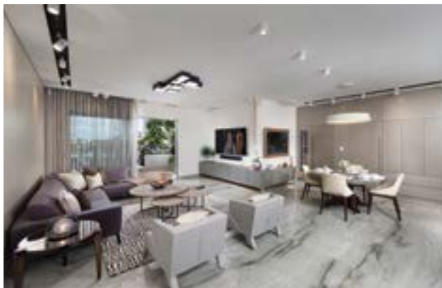
Note: photo illustration is from manufacturer's product catalogue