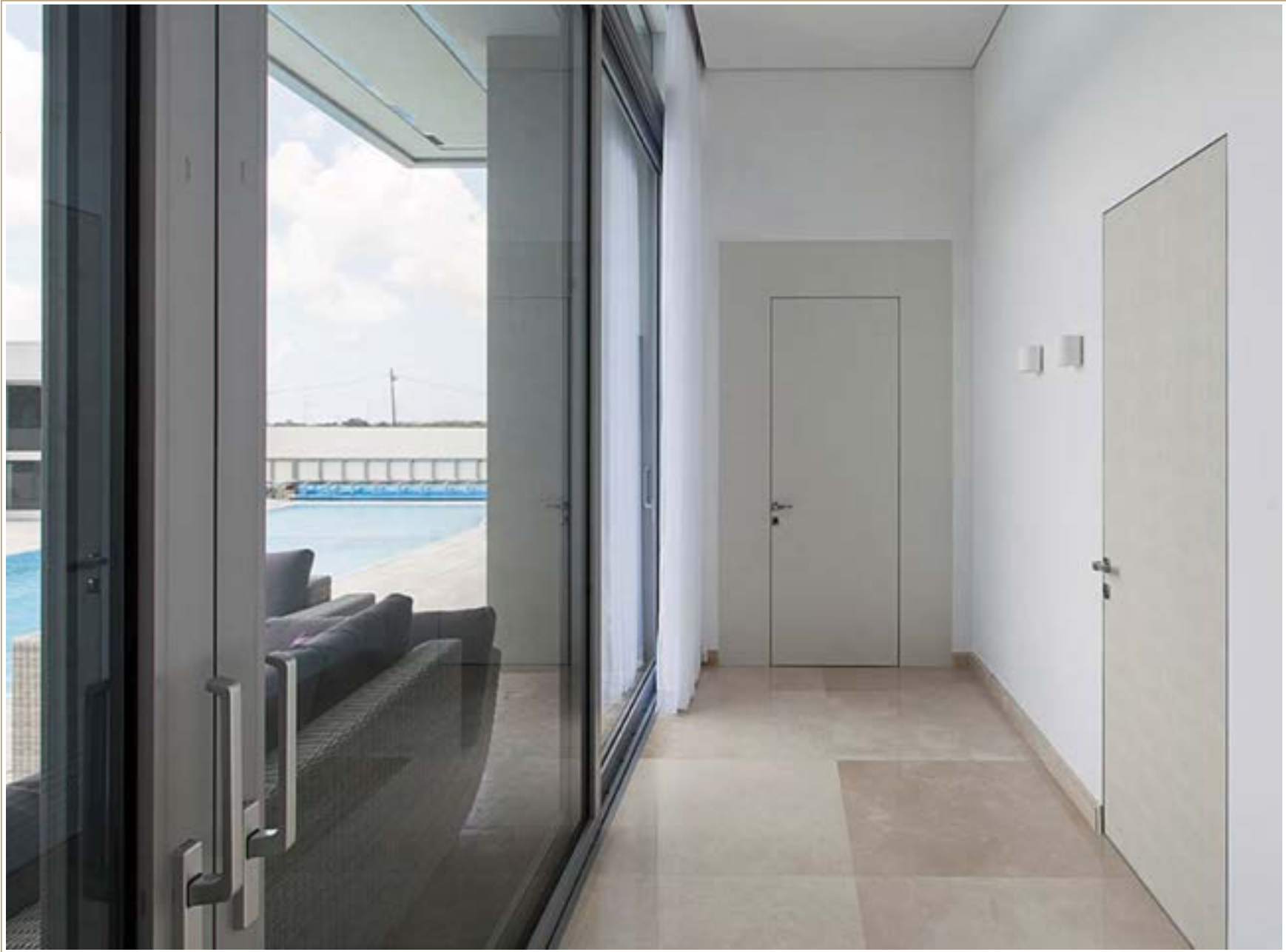
Note: photo illustration is from manufacturer's product catalogue