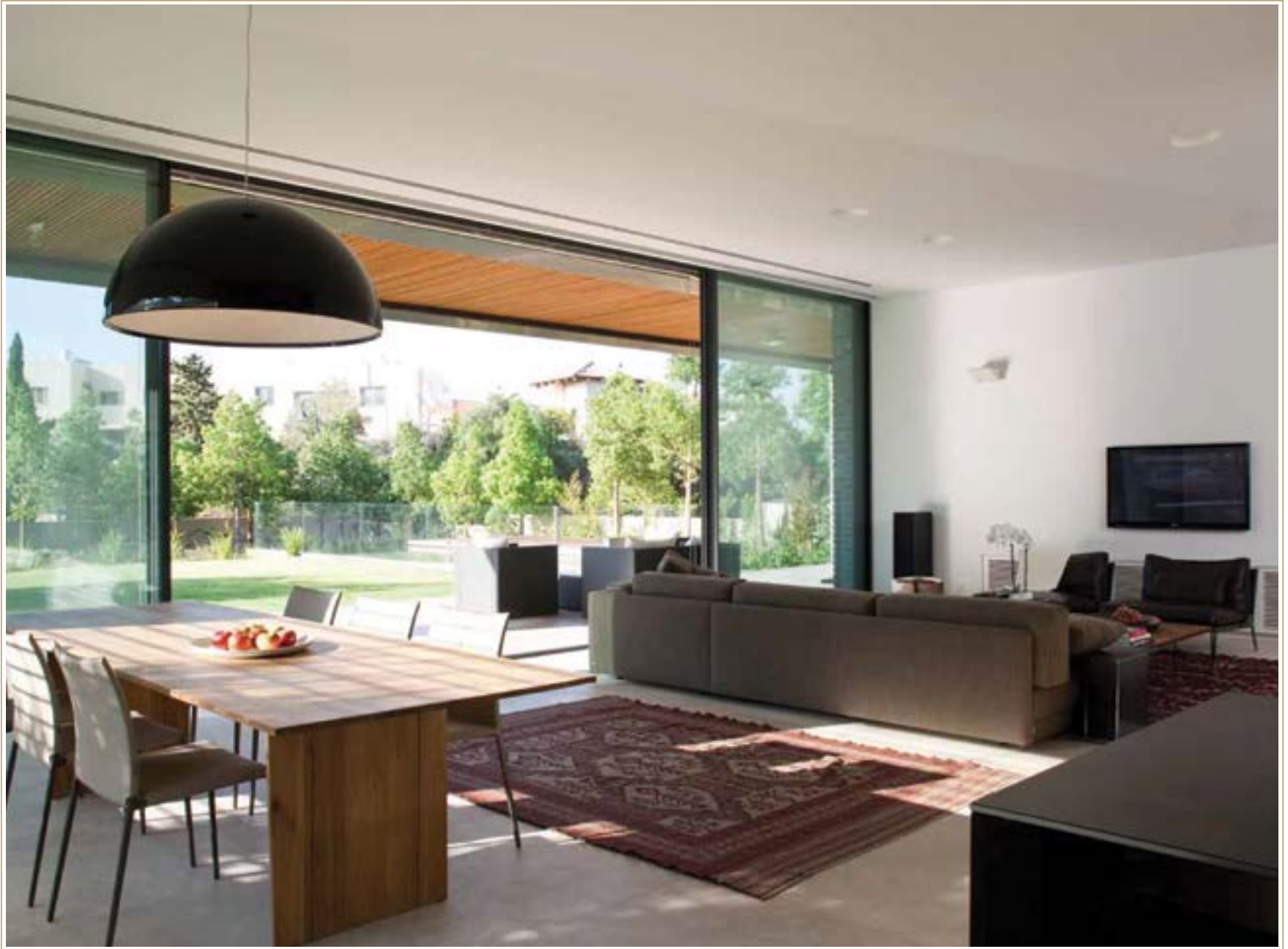
Note: photo illustration is from manufacturer's product catalogue