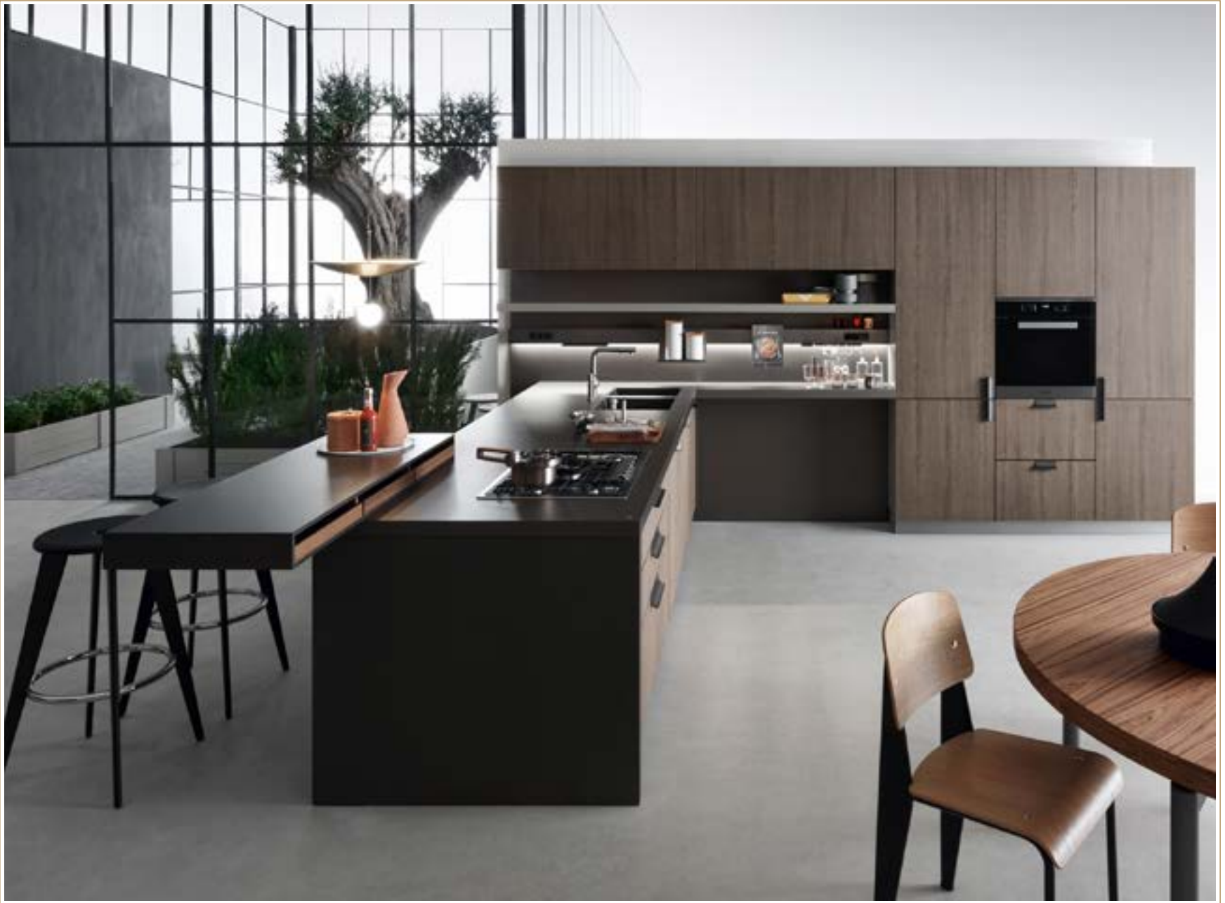
Note: photo illustration is from manufacturer's product catalogue