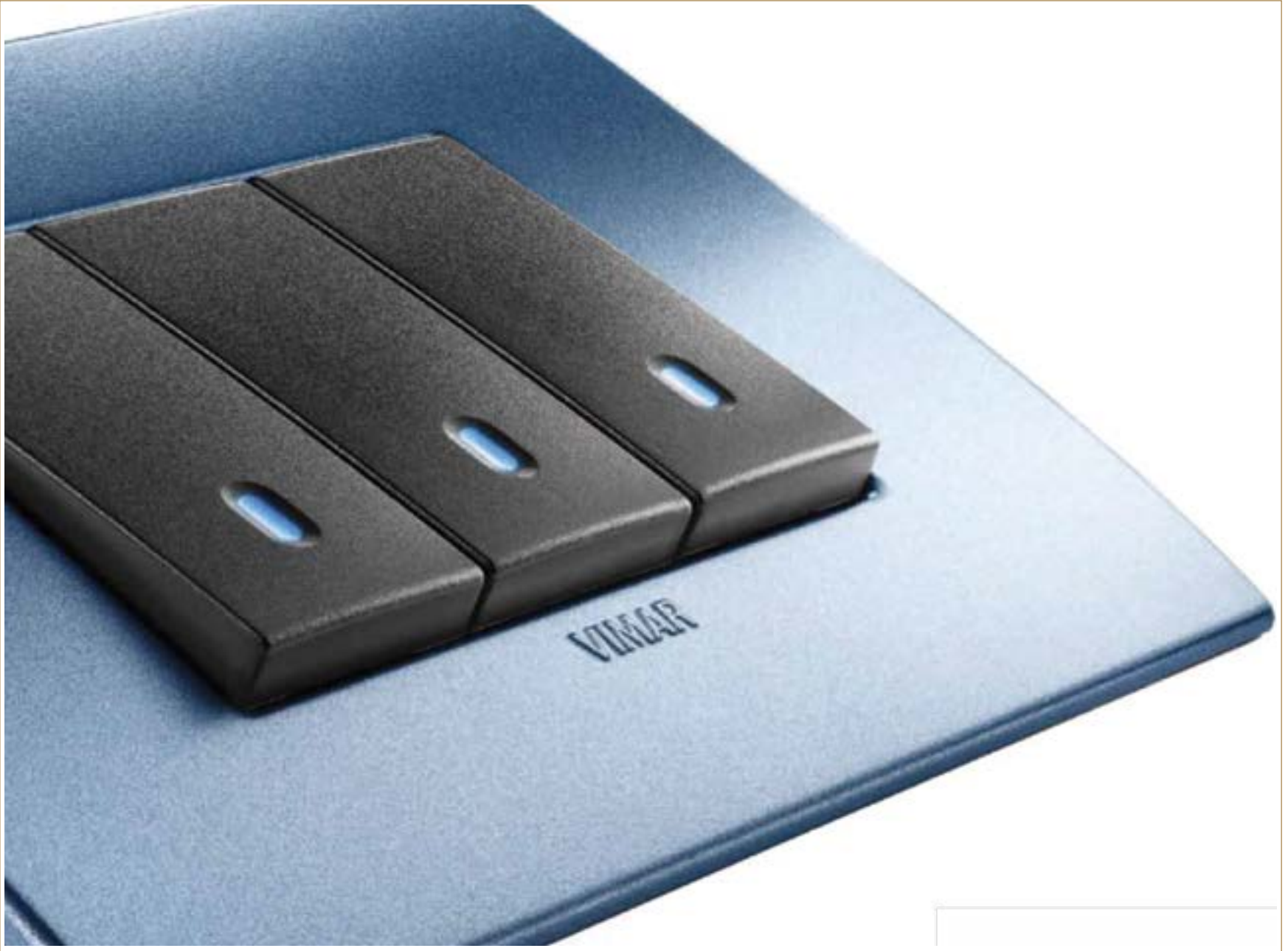
Note: photo illustration is from manufacturer's product catalogue