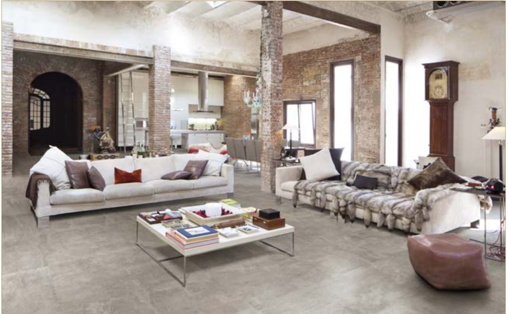
Note: photo illustration is from manufacturer's product catalogue