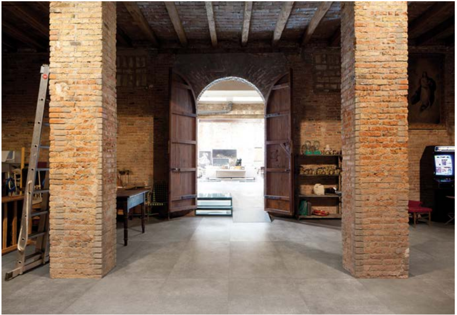
Note: photo illustration is from manufacturer's product catalogue