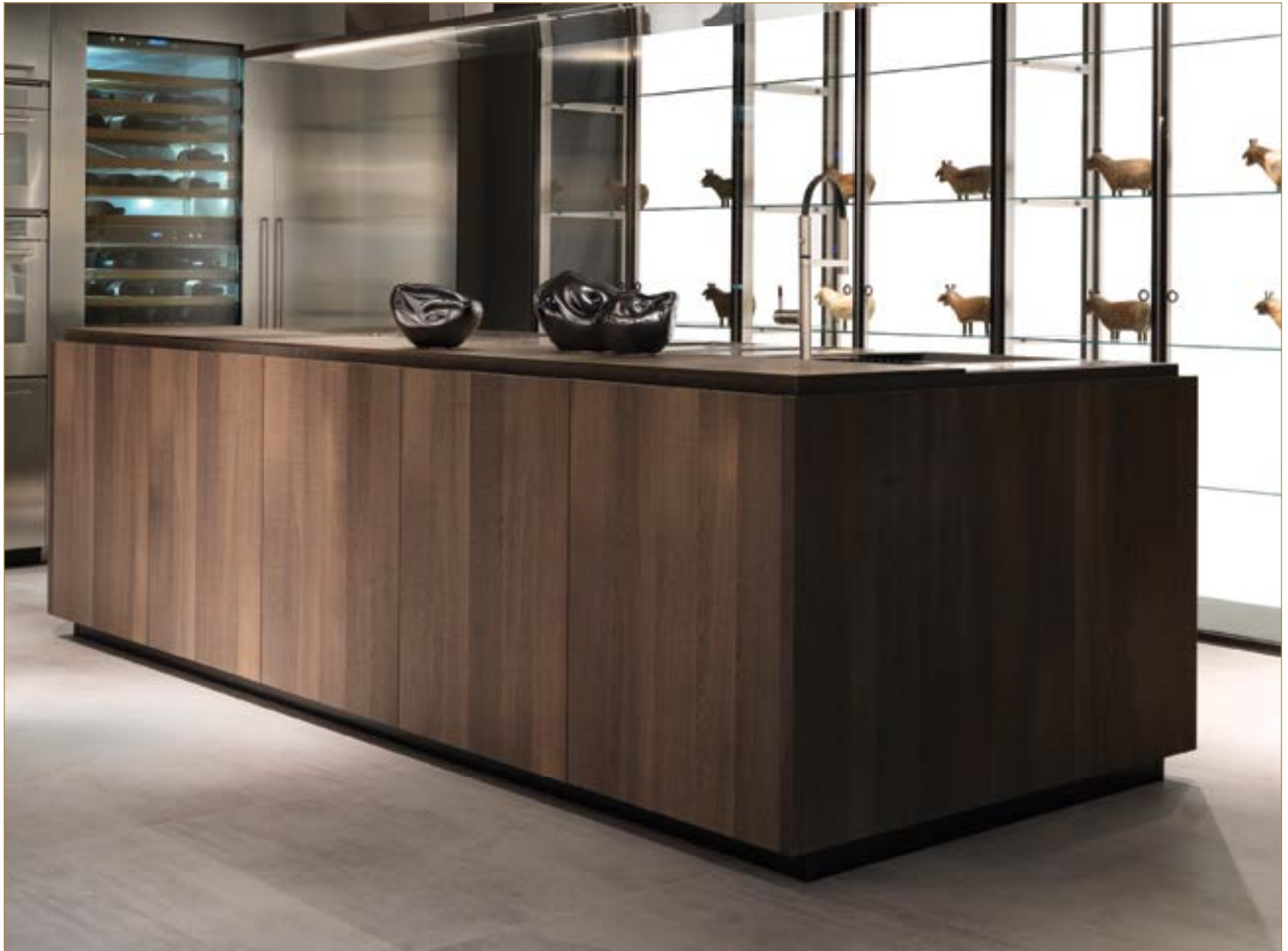
Note: photo illustration is from manufacturer's product catalogue